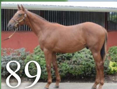
c. BELLAMY ROAD x Champion Marva Jean

SIRE OF AN INCREDIBLE 8.8% SW FROM FOALS*