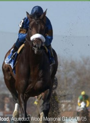
Bellamy Road, Aqueduct Wood Memorial G1 04/09/05